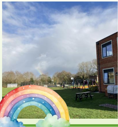
Oak class spotted a beautiful double rainbow on their way to the food room!

The whole of Oak class have unusually been awarded 'Star Baker' this week due to their excellent team-work and willingness to try new things in their food and cooking lessons!