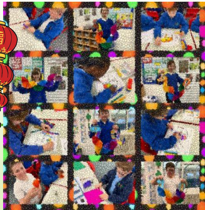
Oak class have also been getting creative with Chinese New Year art, making paper fan snakes. We have had some decorations around school to recognise this festival.