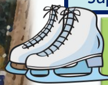
Super speedy ice-skating!