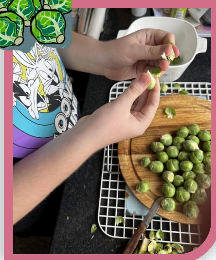
It's wonderful to see pupils supporting with cooking and preparing vegetables at home.