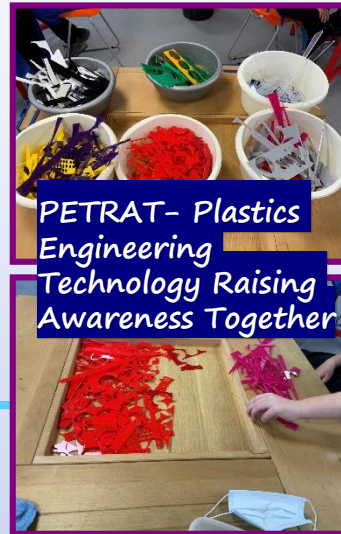
PETRAT- Plastics Engineering Technology Raising Awareness Together